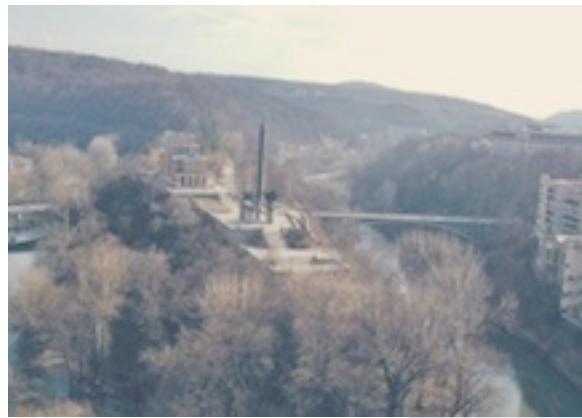
Monument Asenevci Veliko Tarnovo

Part of EASA 2014 19 | 07 - 03 | 08 | 2014